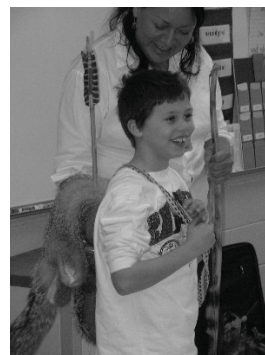
Enriching the Science curriculum at the East Falmouth Elementary School.

Once a project has been funded, a member of the Education Committee follows up on the project during the following academic year with a visit to the classroom and conversations with the teacher who requested the grant. Usually one or two teachers are asked to come to a Board meeting during the year and tell the Board about the success of their project. The teacher's enthusiasm and expertise, coupled with the difference a few thousand dollars can make in a classroom, are exciting for the Board to see.