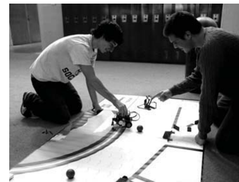
Falmouth High School students find out whether their physics calculations were correct when they programmed their Lego robots to move about.

FALMOUTH EDUCATION FOUNDATION P.O. Box 1061 FALMOUTH, MA 02541 FALMOUTHEDUCATIONFND@GMAIL.COM WWW.FALMOUTHEDFND.ORG